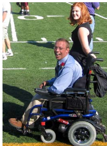
Homecoming King Finalist

are friends who know how to make me laugh, know how to make me listen, and know just what to say when there's something I need to hear, even if I'm not quite ready to hear it. I must confess that it is at this point that I am running out of words to describe the