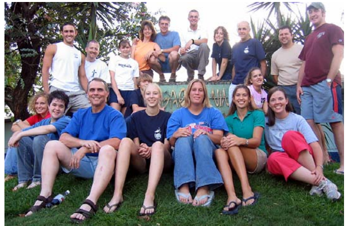
Guatemala mission team including members from Chapel UMC Pennsylvania

and not remembering any selfishness speaks loudly. We will be going back to Guatemala during spring break. Several students are