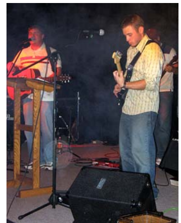
Wesley Band at 2M