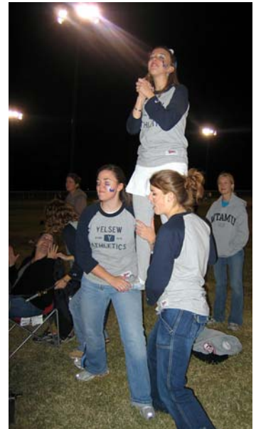
Yelsew Warriors Cheerleaders

unusual rain showers that we had in the Panhandle. So we didn't play very many intramural games. We did however team up with another campus ministry, Chi Alpha and play football for hours on end after church services on Sundays during the months of September and October. When we did get to play your Warriors played with their heart. At our only regular season game that we were able to play we won the hearts of the other team by inviting them to pray with us before we went to battle and after the dust cleared. We did however end up victorious on the field, but mainly because of a relationship with three of the other team members that has developed by just talking to them after that game. I know that it was special to them and ourselves because every time they see us our conversa-