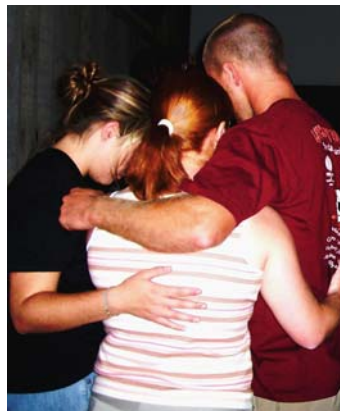
Students praying at 2M

I believe that there is something about agreement and unity between believers that attracts the Father's attention. Similarly, it seems the preceding verses are teaching us that unity is so important we are to openly confront that which compromises it, decisively.